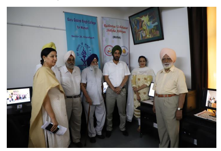
Inauguration of Research Lab