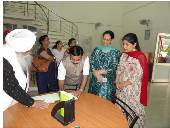
Number of books documented in library register